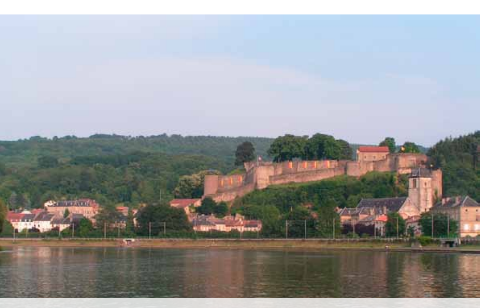
"...The evening light over Sierck-les-Bains..."

the locks with commercial vessels and other leisure craft.