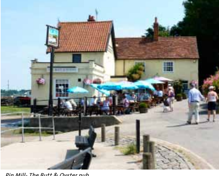
Pin Mill- The Butt & Oyster pub

species of birds, Chinese water deer and hares. The size of this reserve fluctuates as gravel is washed ashore and washed away by waves. The nearby town of Orford probably used to have a sea view. We dropped anchor in these magnificent surroundings! We jumped into our dinghies and visited Orford.