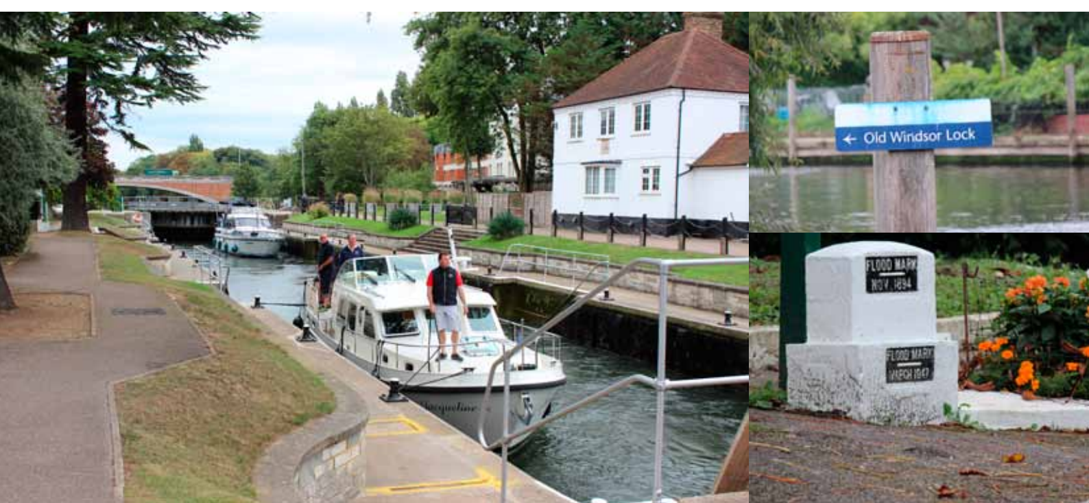
Boulters Lock, Maidenhead

After a stroll around Marlow, we cruised on to Harleyford Estate, which is situated in a picturesque location off to the side of the Thames. There has been a marina here since 1950, in between the Temple and Hurley locks. The estate is a kind of park with residential properties