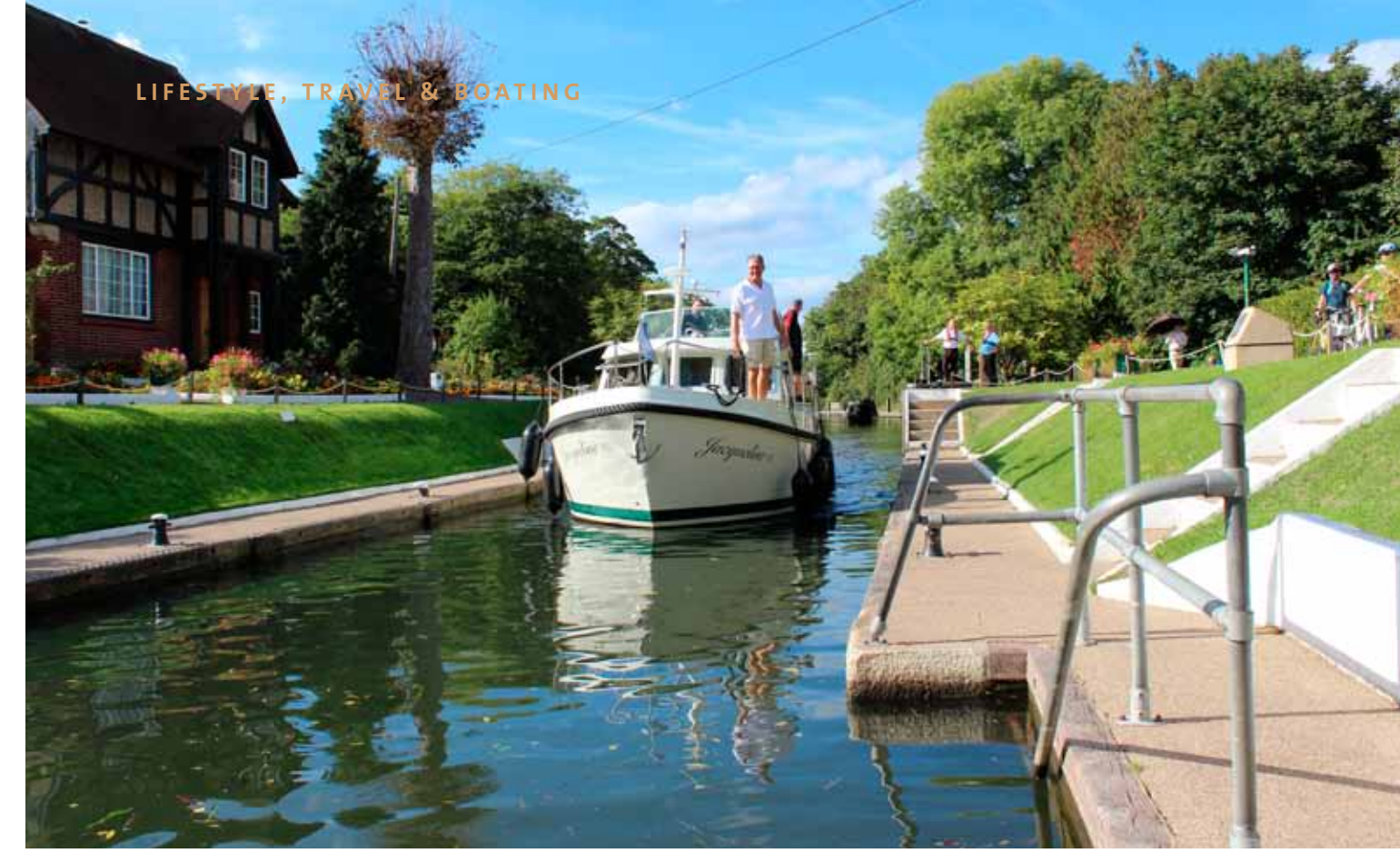
Text and photographs: Luc Vanthoor