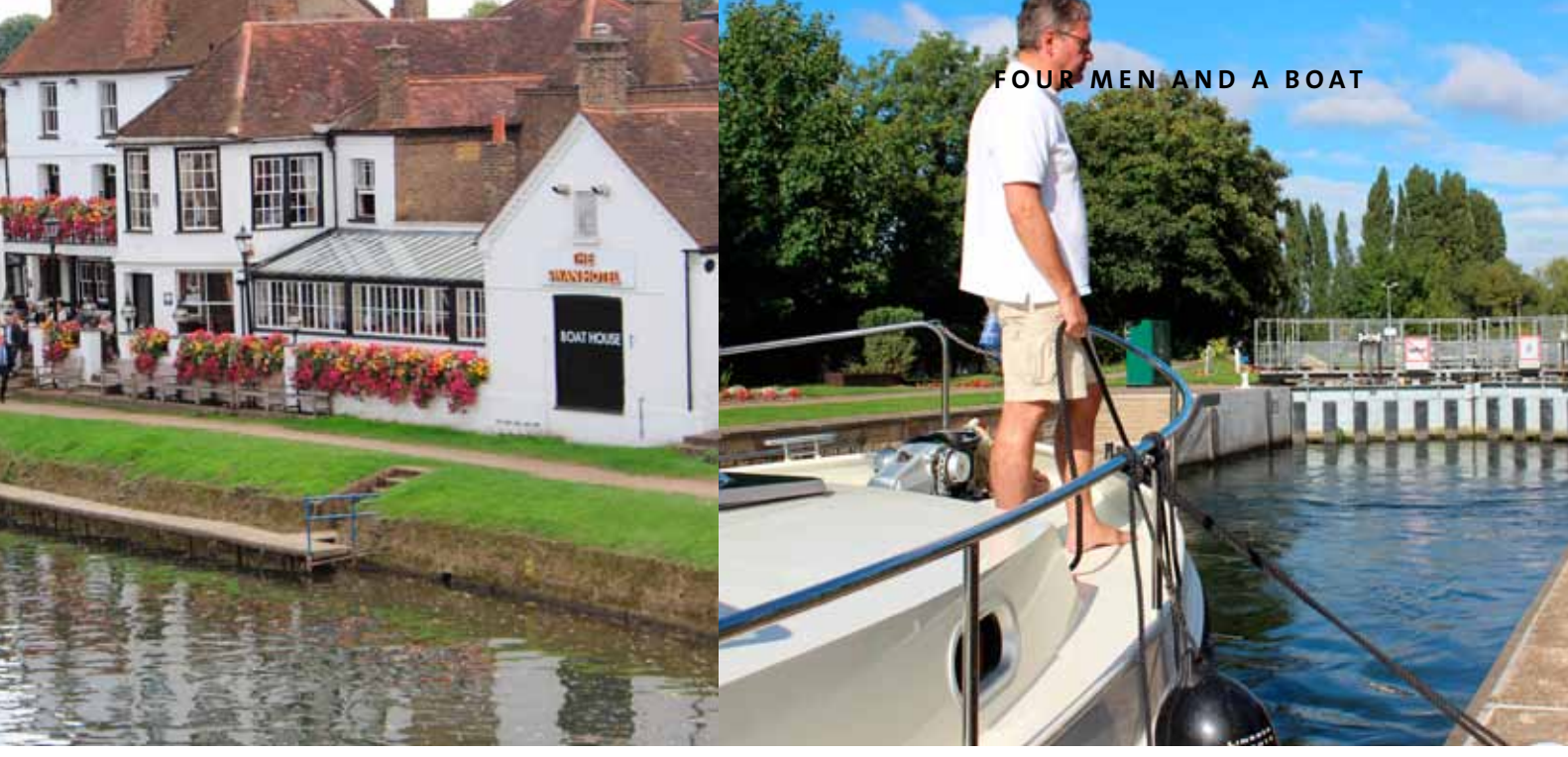
The Swan Hotel, Staines

and holiday homes and is just a short walk from Marlow. We had the final dinner of our trip at the "Showboat", a restaurant on an old barge. After a splendid meal, we enjoyed the last of our stock of wine on the stern deck of the Jacqueline IV. The next day, we returned the boat to Hobbs of Henley and our special adventure came to an end.