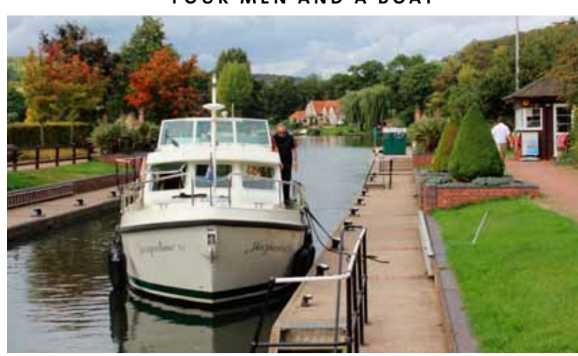
It's teatime, so that means self-service at the lock

The river wound before us through the picturesque landscape. Wide meadows full of sheep, weeping willows that